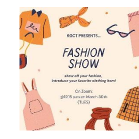
Digital Fashion Show