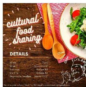
Cultural Food Sharing