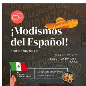
Mexican culture event