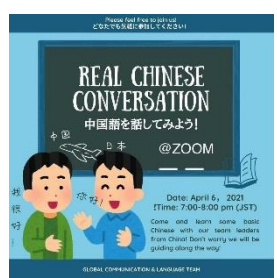
Chinese Talk Cafe